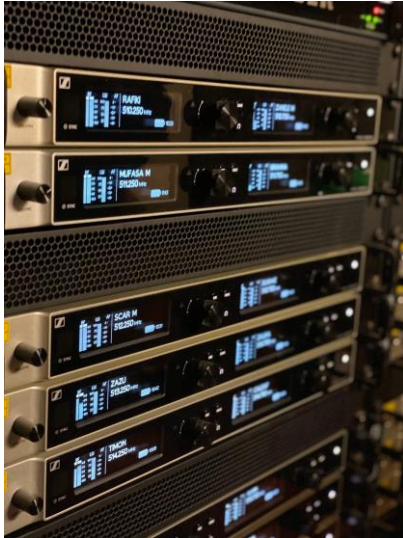
Sennheiser Digital 6000 series rack used on The Lion King musical